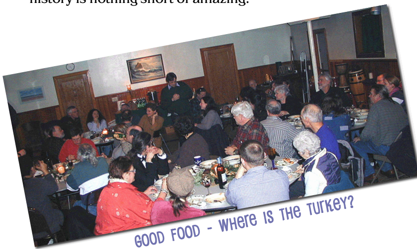
GOOD FOOD - WHERE IS THE TURKEY?

One brother said, to be a part of something so important to the community and has such a long and beautiful history is nothing short of amazing.