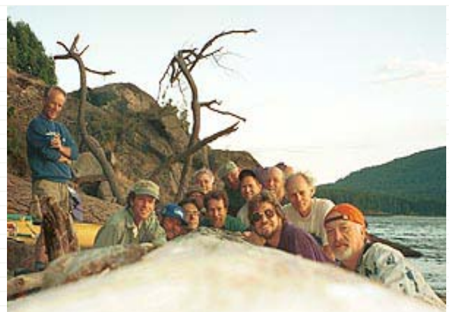
Point Doughty Meeting & Camp-over August 2000